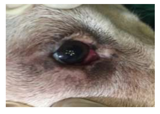
Figure 7. Eye represented normal after 2 weeks of the surgery