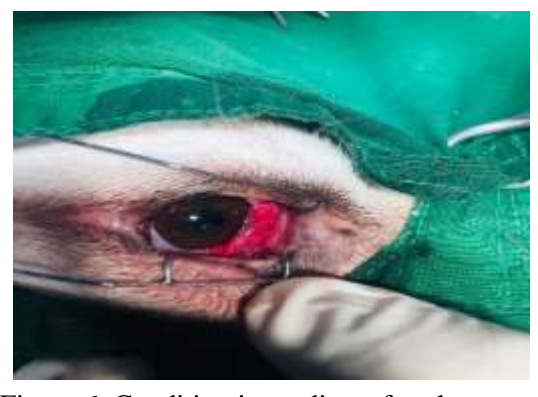
Figure 6. Condition immediate after the surgery