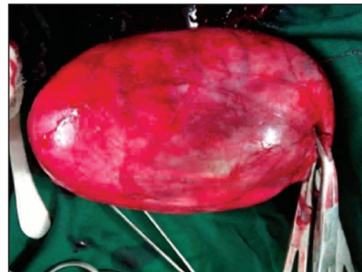
Figure 2. Surgical removal of the enlarged testicular mass