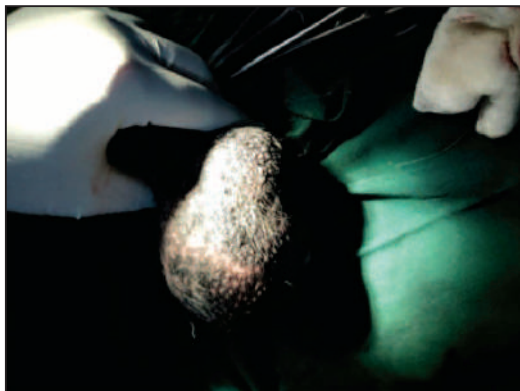
Figure 1. Enlarged testicular mass

Based on the gross and histopathological observation, the tumor was characterized as seminoma, which shows the rapid growth rate, high proliferative capacity.