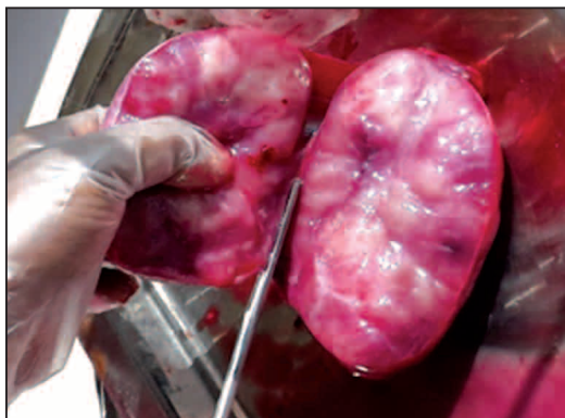
Figure 3. Hemisected orchioectomy specimen showing nodules with a glistening cut surface and cystic spaces separated by fibrous sept